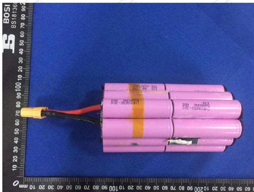
Photo 3 Internal Cell 内部电芯