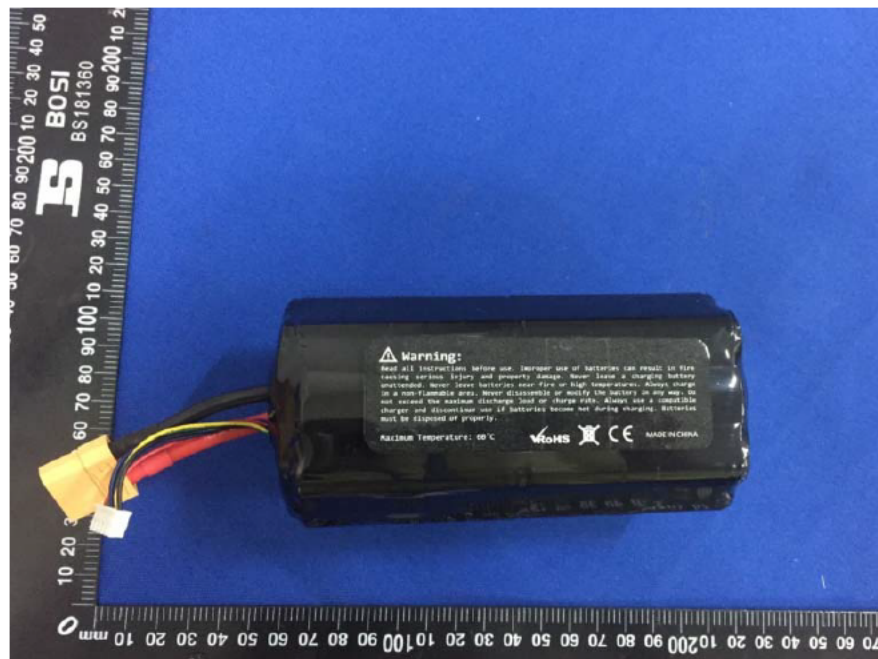
Photo 2 Rear 反面